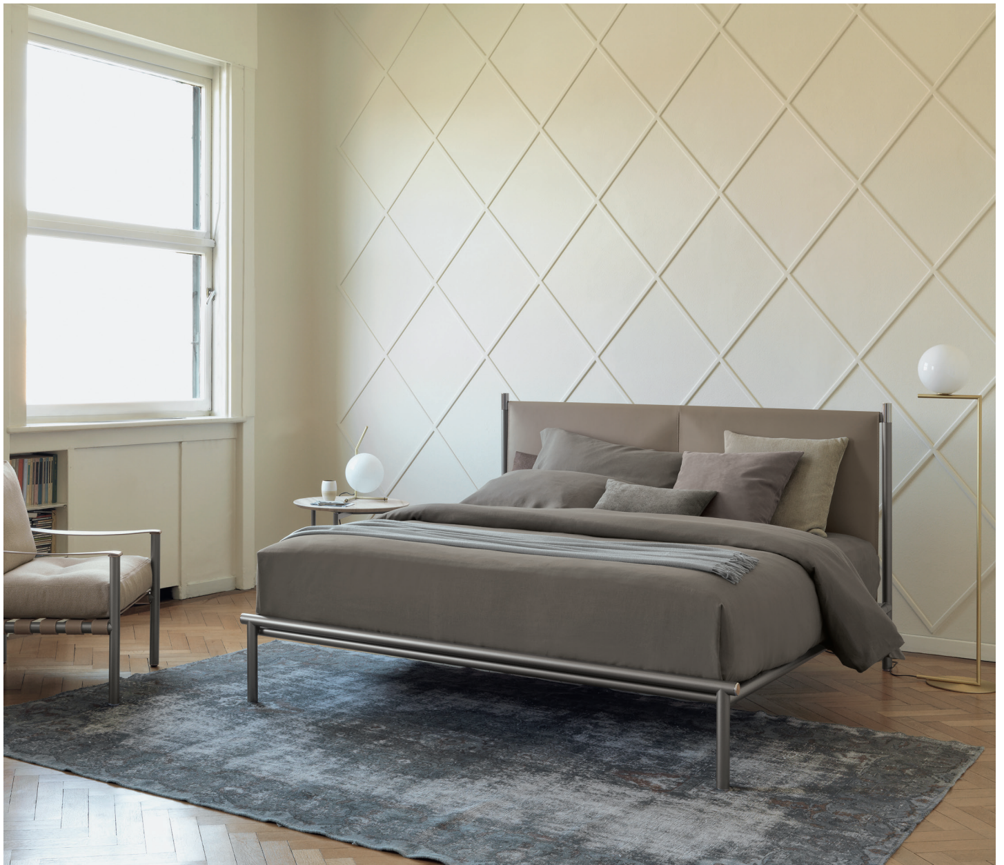
IKO DOUBLE design Rodolfo Dordoni 2015

Elegance, exclusiveness and understated luxury are the key features of this double-size bed; its apparent simplicity is defined by the purity of the lines, the quality of the materials used and the elegance of the details. Demountable steel tube structure in matt burnished finish. Details in glossy gold or glossy black nickel. Hide headboard cover available in the colours: natural, moka, black, burgundy, tobacco, sand, mud, nut brown, dove grey, ash grey and mastic grey.