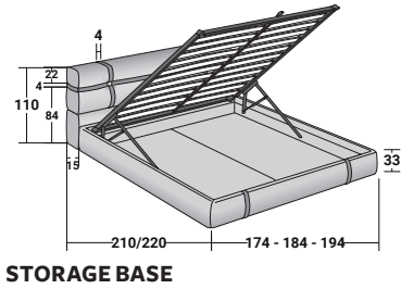
ADJUSTABLE SLATTED BASE