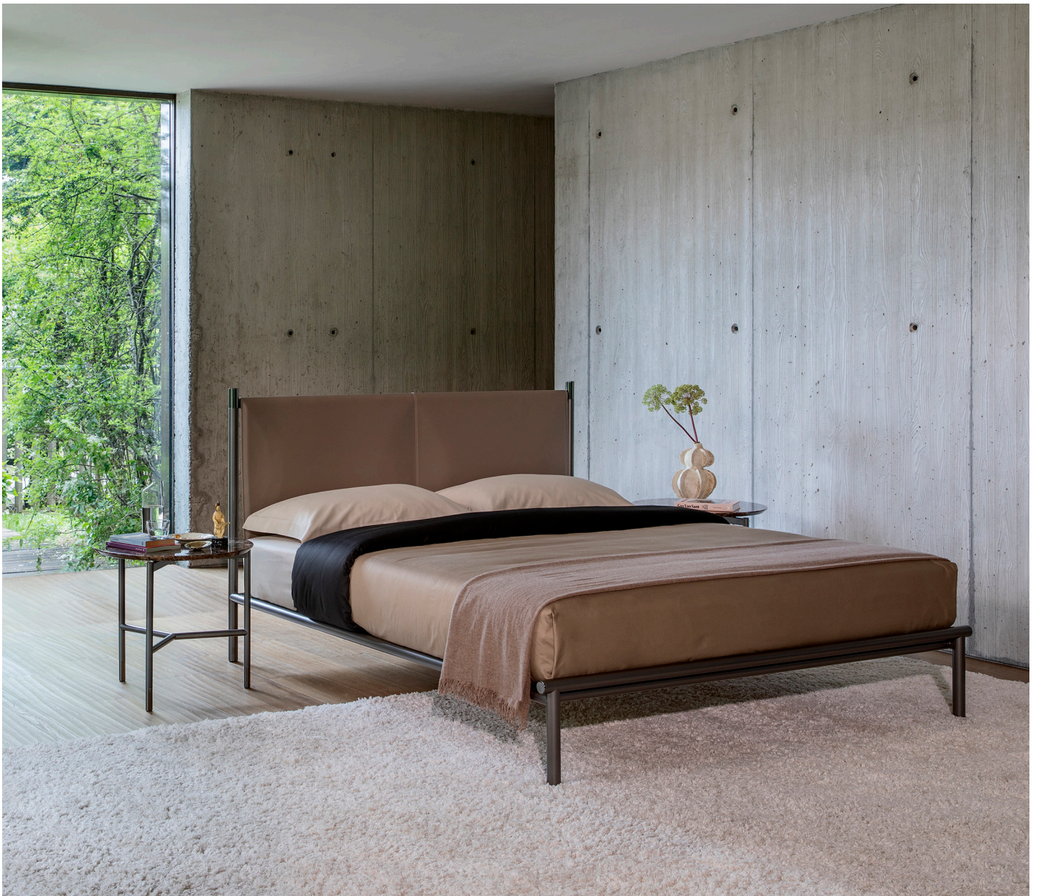
IKO DOUBLE design Rodolfo Dordoni 2015

Elegance, exclusiveness and understated luxury are the key features of this double-size bed; its apparent simplicity is defined by the purity of the lines, the quality of the materials used and the elegance of the details. Demountable steel tube structure in matt burnished finish. Details in glossy gold or glossy black nickel. Hide headboard cover available in the colours: natural, moka, black, burgundy, tobacco, sand, mud, nut brown, dove grey, ash grey and mastic grey.